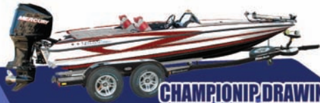
CHAMPION DRAWING 19' PACKAGE

ODYSSEY BATTERIES CARLISLE TIRES AND WHEELS