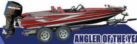
ANGLER OF THE YEAR 21' PACKAGE