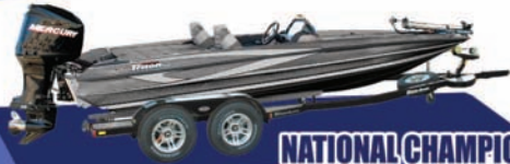
NATIONAL CHAMPION 21' PACKAGE